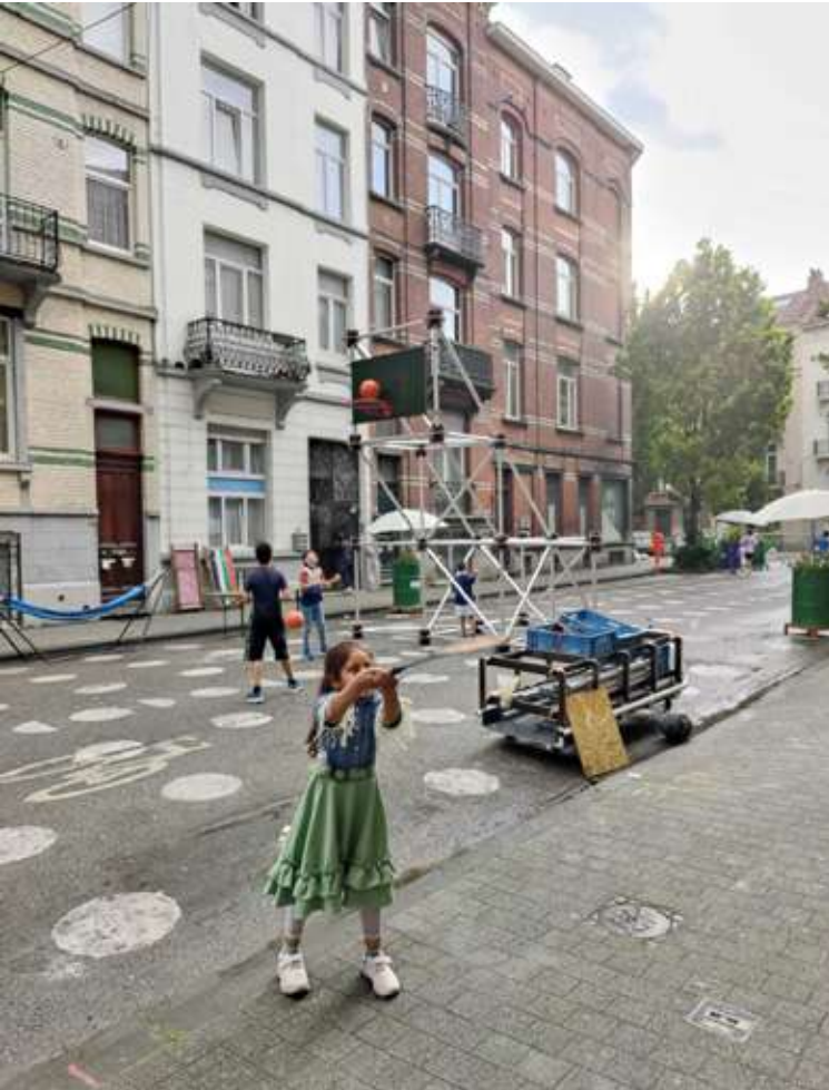
Broedplek basket