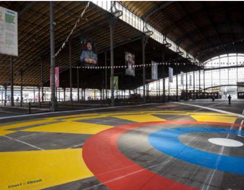
Court Circuit Dartfleche