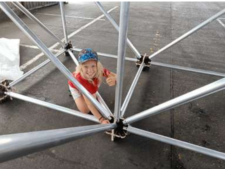
Court Circuit Race