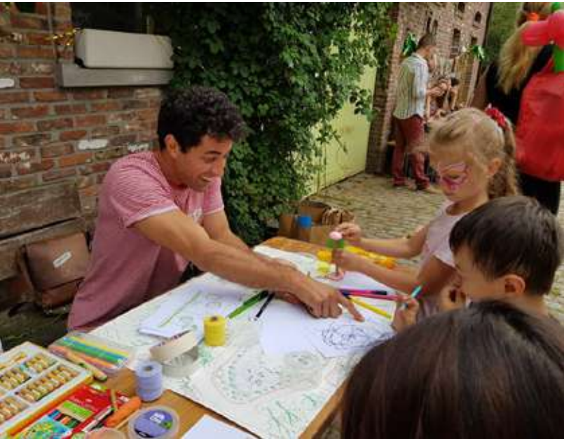
Adventure Playground 21' - MEOW - Workshop