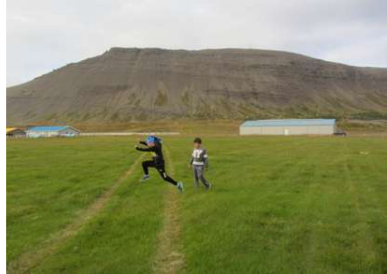
PLAY